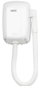
SC0009 White finish