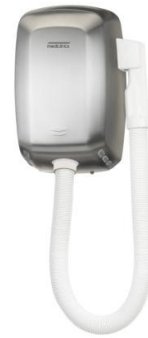
SC0009CS Satin finish